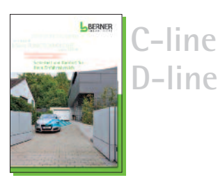
Swing and sliding gate openers

Underground car park and industrial door openers