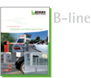
Gated lock-ups and car park barriers